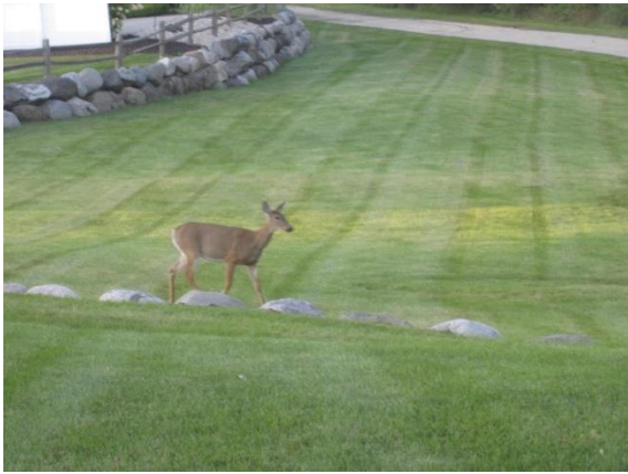
Barb Dosemagen says "we have a loner."

And I caught this mama turkey with four chicks near the intersection of Fremont and Burr Oak Trail. The same group were in our back yard a couple days later.