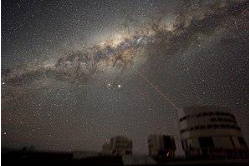
Image of Milky Way Galaxy from Earth

Below is an artist's rendering of what our Milky Way Galaxy looks like. We can only see it "on-edge" from the Earth.