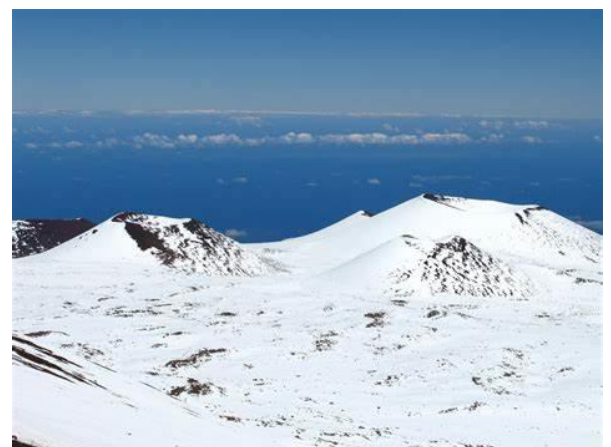
Above: Mauna Kea, Big Island