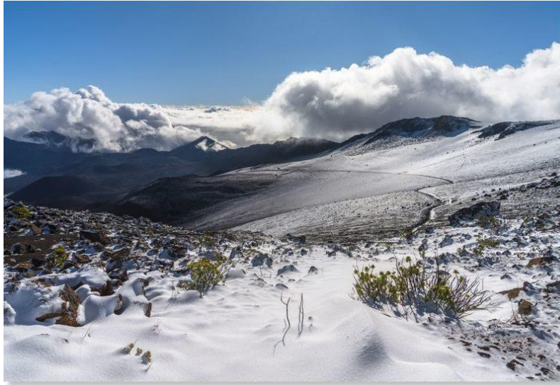
Above: Haleakala (on Maui)

FYI: all 3 volcanoes were capped with glaciers at one point in time during the various Ice Ages. In fact, Haleakala was estimated to be at least a couple thousand feet taller prior to its magma chamber partially collapsing and also erosion due to precipitation.