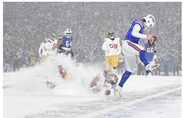
Buffalo Bills quarterback Josh Allen, right, scores past San Francisco 49ers linebacker Fred Warner, bottom, during the second half of an NFL football game in Orchard Park, N.Y., Dec. 1, 2024.

Image taken during the early December, 2024 lake-effect snow event in the Ashtabula, Ohio to Buffalo NY area. Snow totals ranged up to 2 to 5 feet over a 2-3 day period!