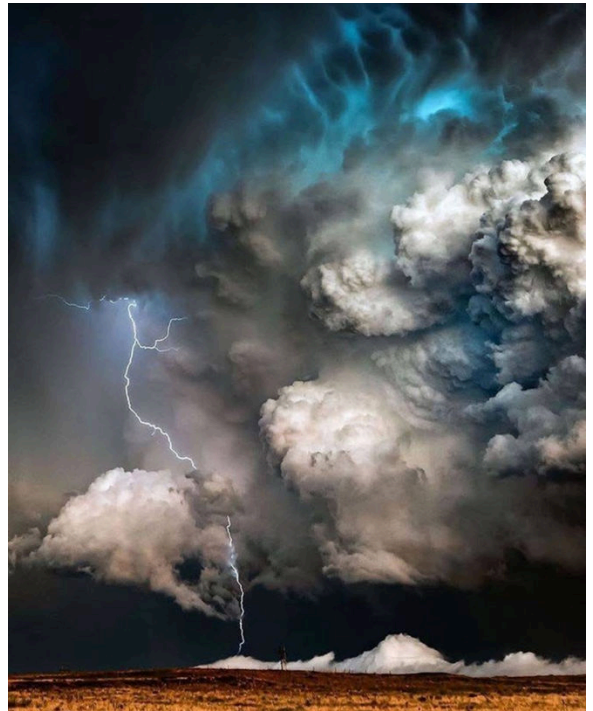
Image to the right: a mature, most likely, severe storm. Some severe storms can grow up to a height of 70,000 feet, but most storms grow only to 35,000 to 45,000 feet. Really scary-looking!

Remember...EVERY rain drop starts off as a snowflake!