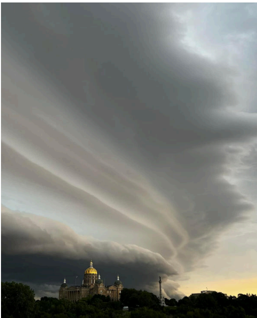
Image to the left: Front side of a line of thunderstorm. The layered, lower portion of the storm is called a shelf-cloud . In many cases it resembles a shelf (or even a snow plow!) when looking at it from the side.

Image to the right: a mature, most likely, severe storm. Some severe storms can grow up to a height of 70,000 feet, but most storms grow only to 35,000 to 45,000 feet. Really scary-looking!