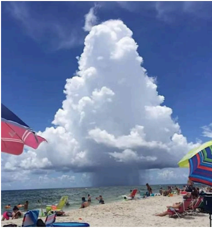
Image to the left: a cumulus congestus cloud almost at the cumulonimbus stage producing rain. The dark streak from cloud base to the ocean surface, under the central part of the cloud, is a rain-shaft consisting of moderate to heavy showers. The straight up-and-down appearance of this cloud (it's not leaning over at a slight angle) indicates there is no wind shear in the atmosphere at that location. Wind shear is needed for a storm to become severe.

Remember...EVERY rain drop starts off as a snowflake!